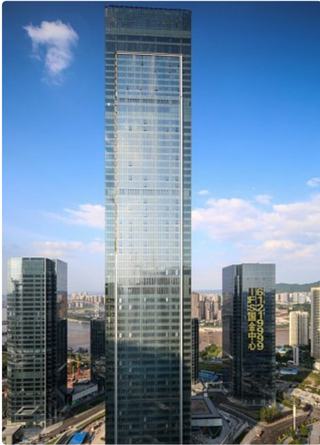
Click an image to view larger version.